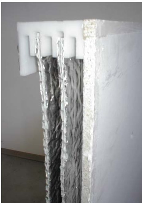
Figure 1 – Picture of the sample.

The test sample consists of a 12 mm magnesium oxide board, a 20 mm air space and two ISOLIVING layers with a 20 mm air space between them (Figure 1). In the thermal resistance calculation, the effect of a further (20 mm) air space after the second ISOLIVING layer has been evaluated.