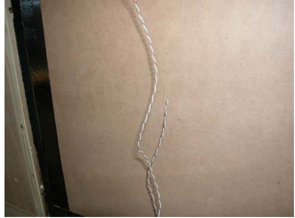
Figure 3 – Wood board with thermal probes placed inside.