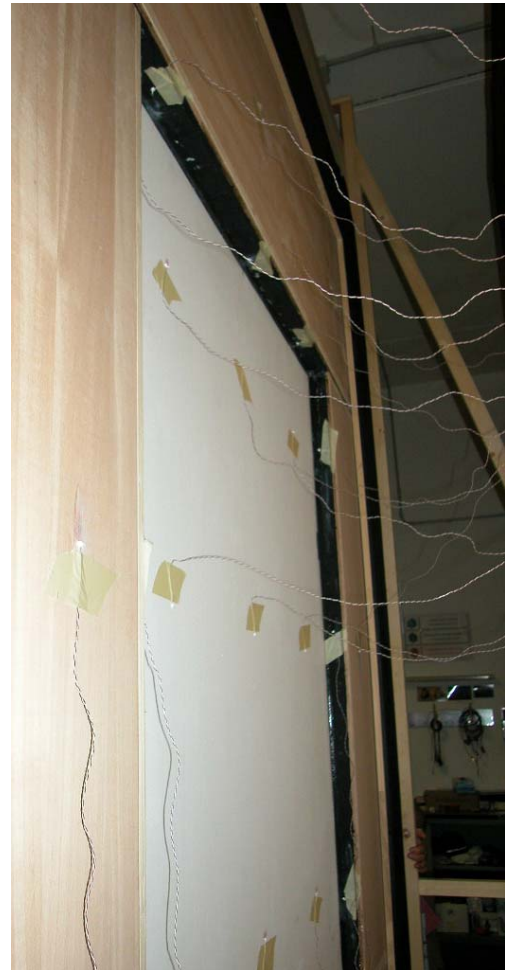
Figure 4 – Sample placed in the measurement apparatus; hot side (wood board) and cold side (magnesium oxide board).