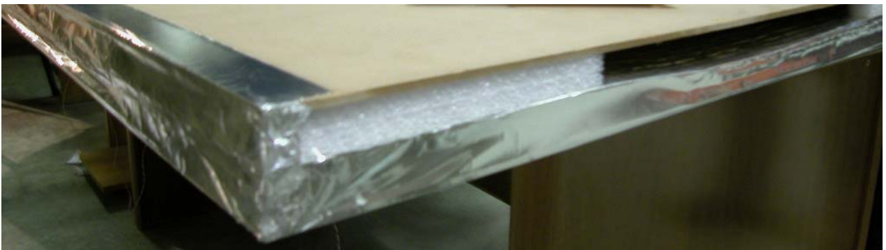
Figura 3 –Building up of the test sample