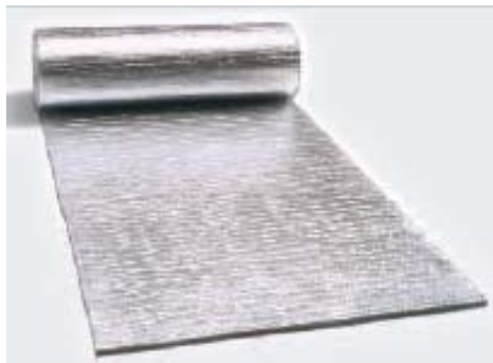
Figura 1 –Isolving board