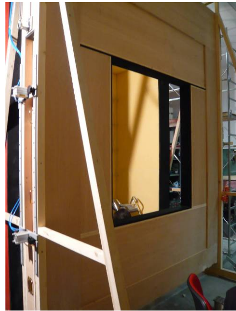
Figure 2 – Measurement apparatus